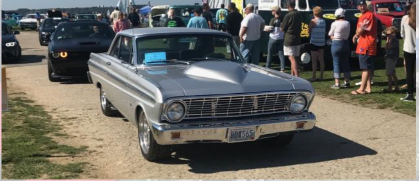
Fort Adam's State Park, Newport RI Car Show, September 24th