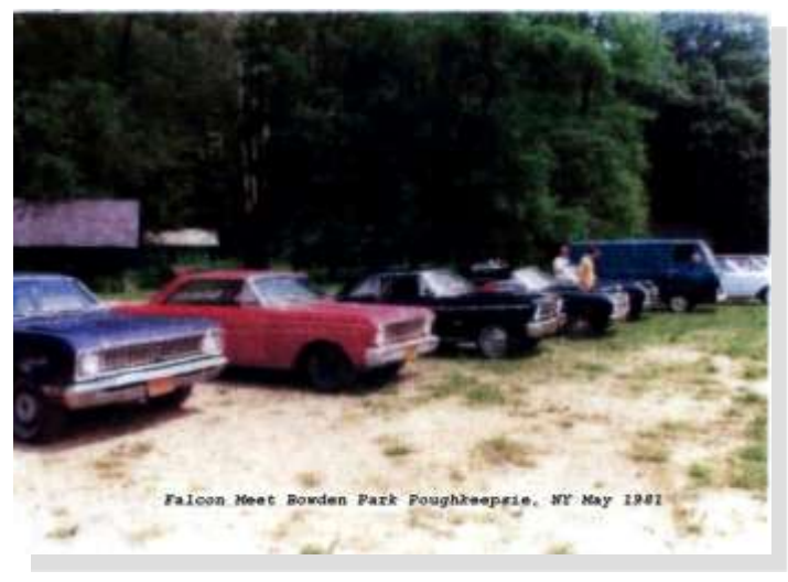
VOLUME 4, ISSUE 2 MAR/APRIL 2011