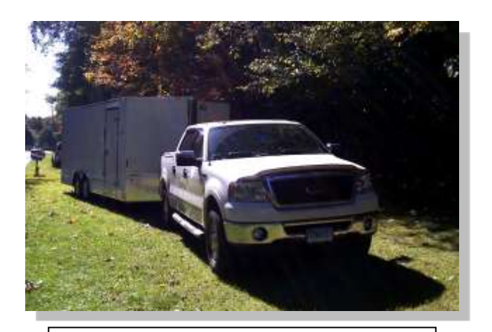
The White 2006 F150 Lariat