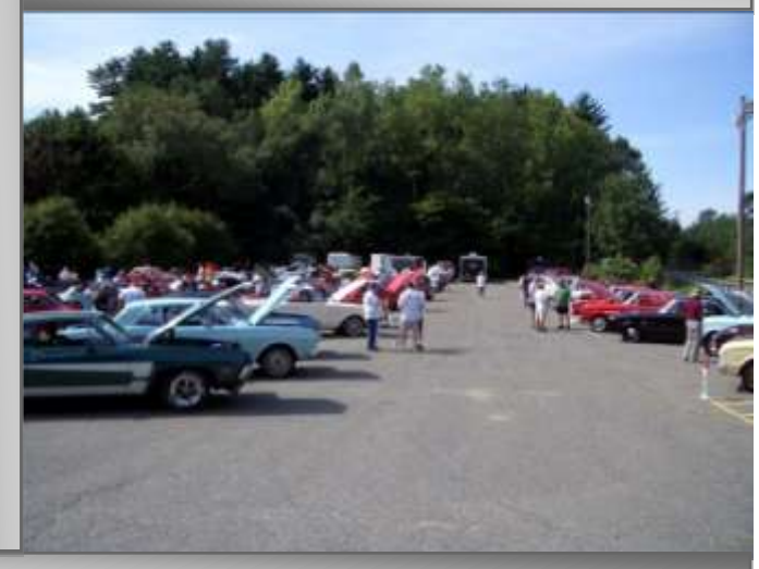
The show lot was full of great looking Falcons, and happy viewers