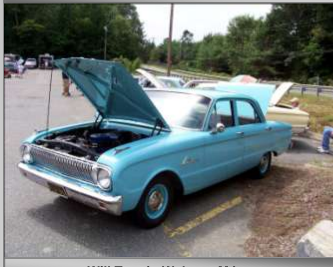
Will Tappin Webster MA