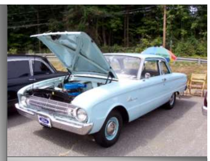
Travis Lipinski Farmington, CT (51,000 original miles)