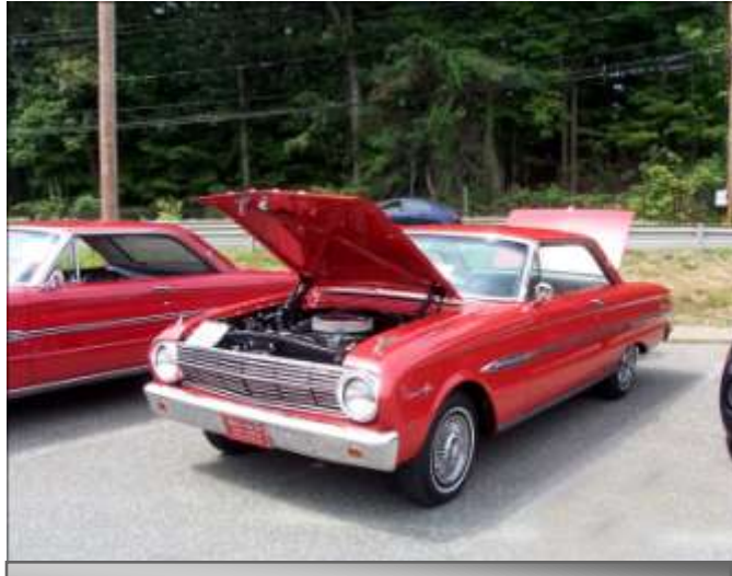
Vinny Delucia Waterbury, CT