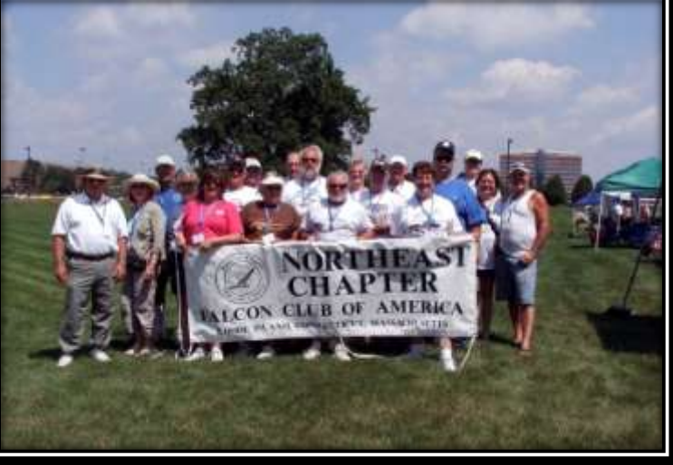
VOLUME 3, ISSUE 4 JULY/AUG 2010