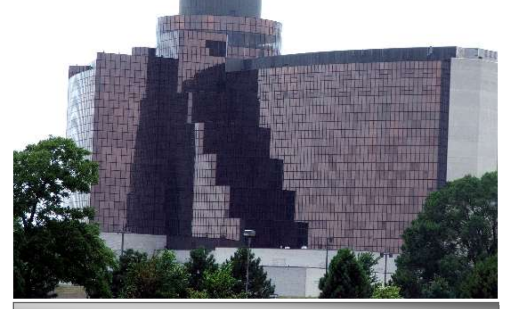
The Dearborn Hyatt Regency Hotel