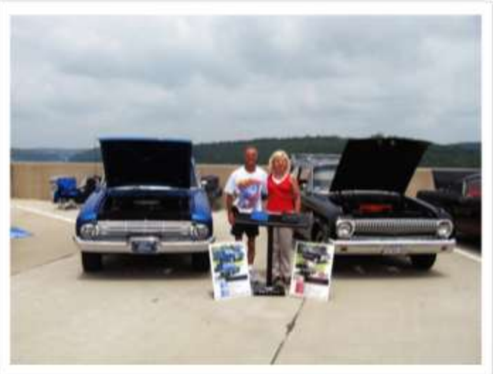
VOLUME 3, ISSUE 2 MAR/APRIL 2010

I have taken the wagon to many car shows, meets and weekend rides over the years. We have driven up and down the east coast from Maine to Delaware. This little car is a "people magnet" it has a quiet but happy personality. Whenever people see the wagon they smile and either ask about it or tell stories of parents or grandparents who had one. They talk about how they have taken theirs to the beach, on camping trips or to the drive-in movies. Others used their wagons for business to deliver groceries, milk and even mail!