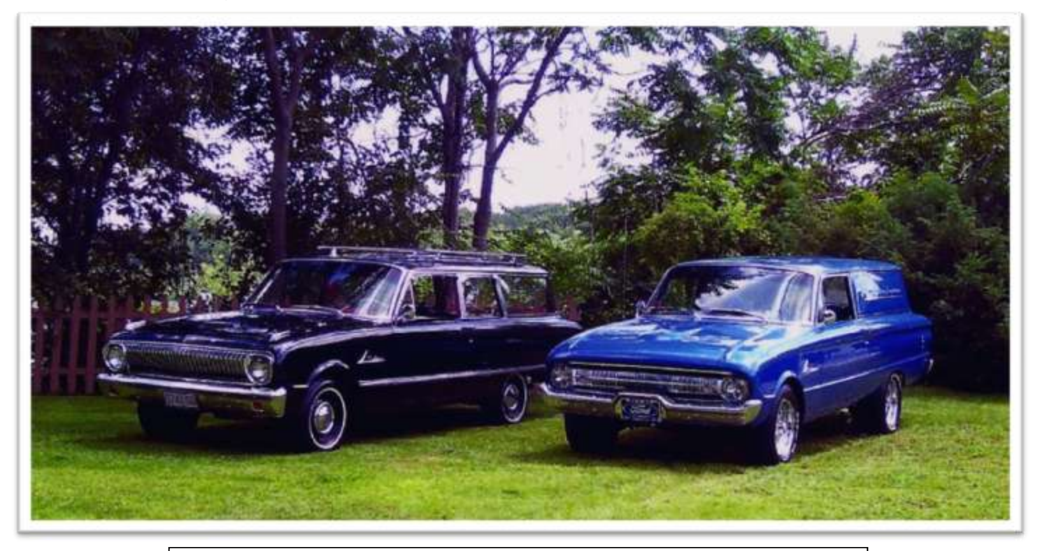
Gail's Ladies Choice and Bruce's Best of Show for 2008

Bruce and I have done many projects together from trucks to boats and now antique cars. We are now a two Falcon family. We are having a lot of fun with both cars and enjoying meeting many nice people wherever we go.