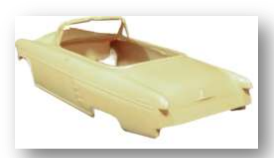
VOLUME 3, ISSUE 1, JAN/FEB 2010

This is the resin kit that I started with, as you can see it came with no engine, wheels, convertible boot or head lights. I removed the fender skirts and windshield film then the body had to be sanded and prepared for painting.