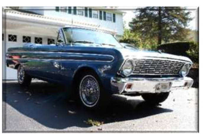
Howard Spargo Sept/Oct