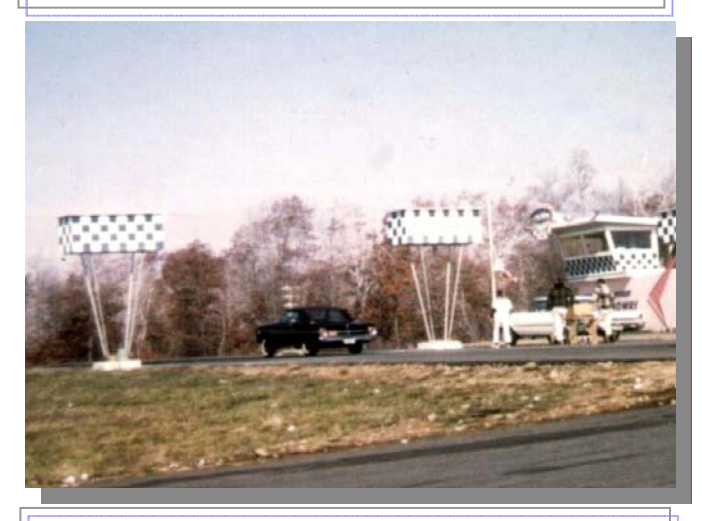
Your editor on the track. (Connecticut Dragway 1964)