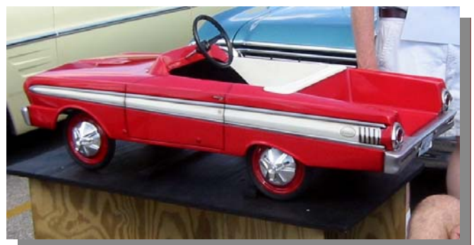
Neat little 64, I wonder if it's a V-8 or six.