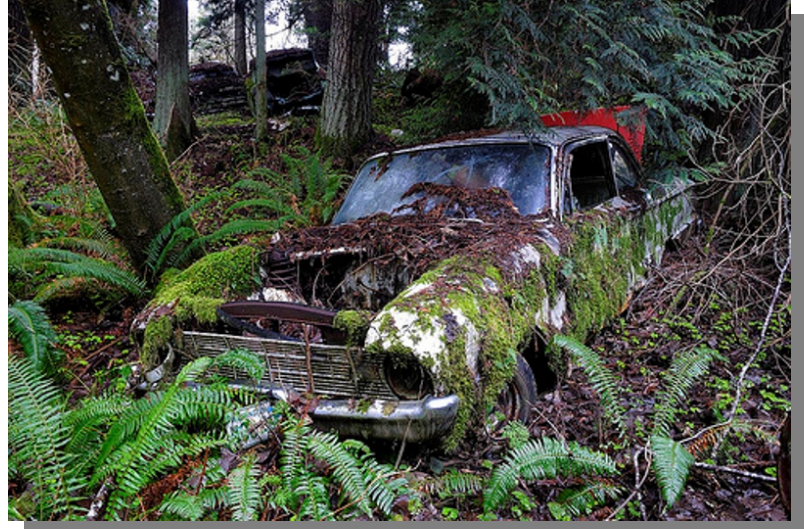
A little wash and wax, and it will look like new.