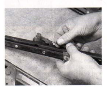
Whenever you are reupholstering seats, clean and lubricate the seat tracks for smooth, reliable operation.