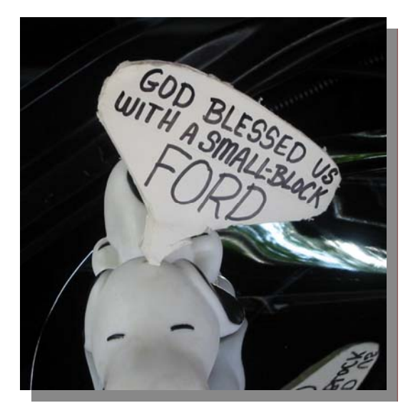
Hang on Snoopy!