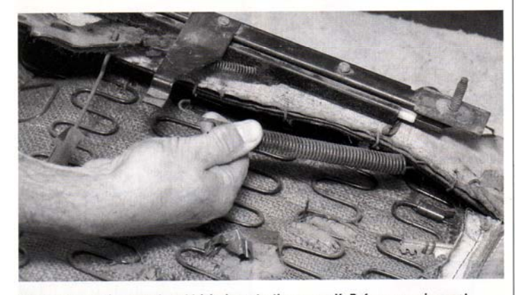
One of the most important seat tricks is protecting yourself. Before removing seat tracks, always carefully remove the helper spring, which will reduce the risk of injury from a runaway seat track.

We see countless restorations with crisp, new upholstery, but seats that work and feel awful. There's the spring that catches you — well — you know where. You're short on legroom. So, you grab the seat-adjustment lever to slide back, only to discover one of the tracks has shown up for work. Maybe the most recent journey found you in the back seat, when the front seatback broke at the pivot. This is all easy stuff to correct.