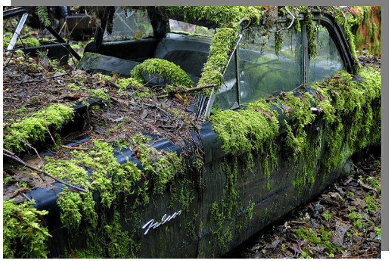
Now, this is one good looking 63.

What do you mean it will take longer than 6 months