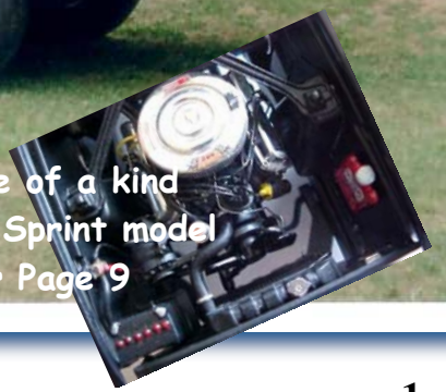
One of a kind 63 Sprint model Car Page 9