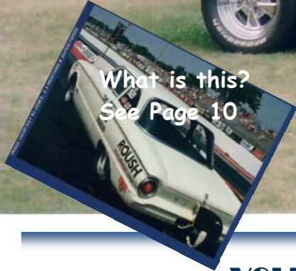
What is this? See Page 10