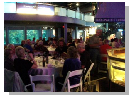
VOLUME 5, ISSUE 5, SEPT/OCT 2012