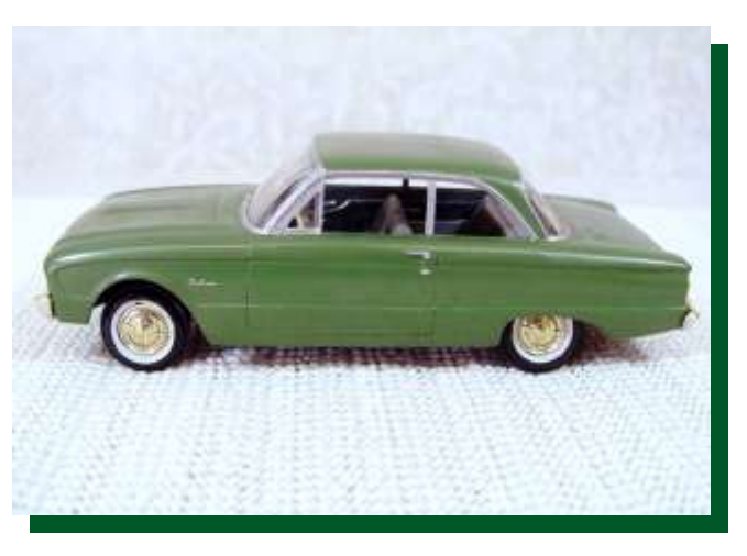
VOLUME 5, ISSUE 2 March 2012