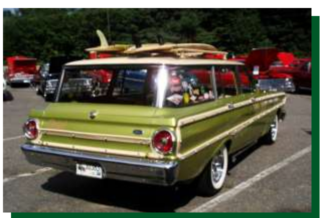
VOLUME 5, ISSUE 2 March 2012