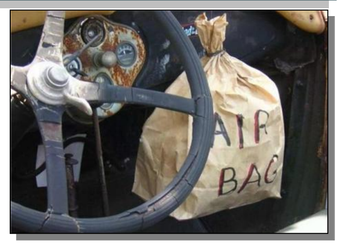
How to install air bags in old cars.