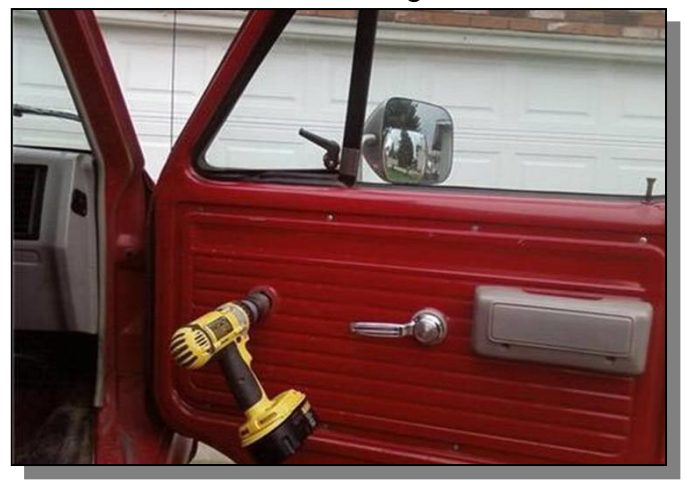
How to install electric windows quickly.