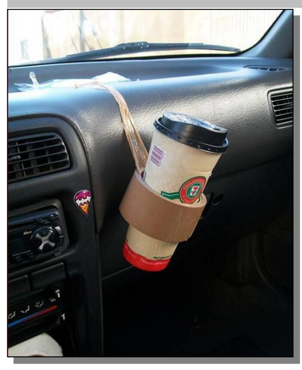
Cup holder to go!

In each issue of The Falcon Times , we will bring you a tech article or an illustration for your technical information. If you would like to see a specific illustration, drop us a line and we will dig it out for you. In this issue, we will address some quick and efficient repairs/installations.