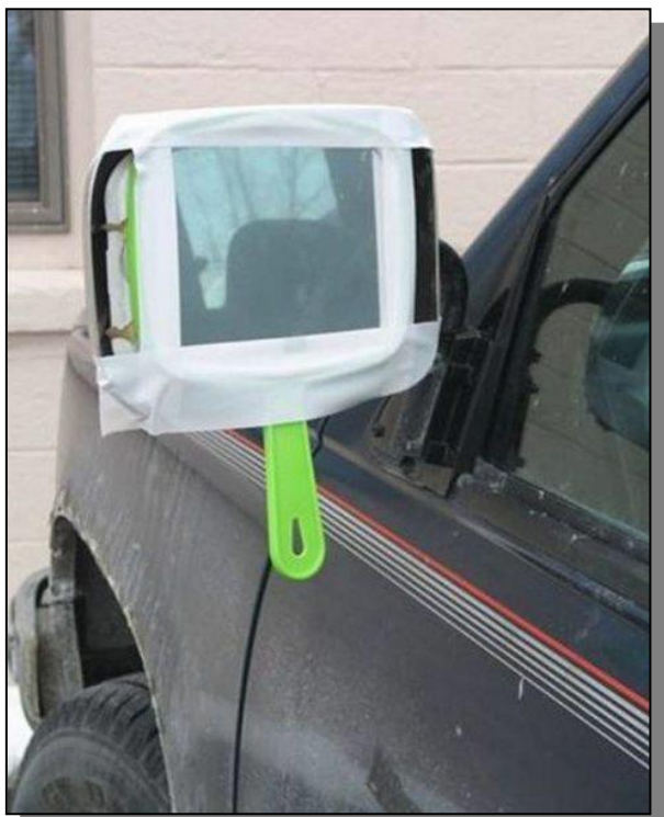
Outside mirror repair (Can also be used on inside mirror by removing handle).