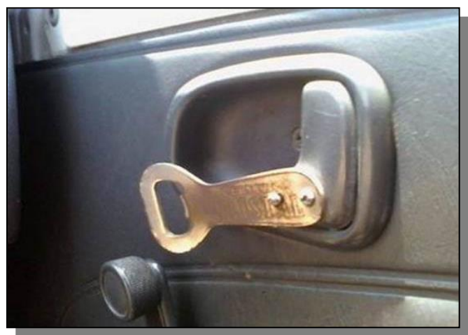
Door handle repair made simple!