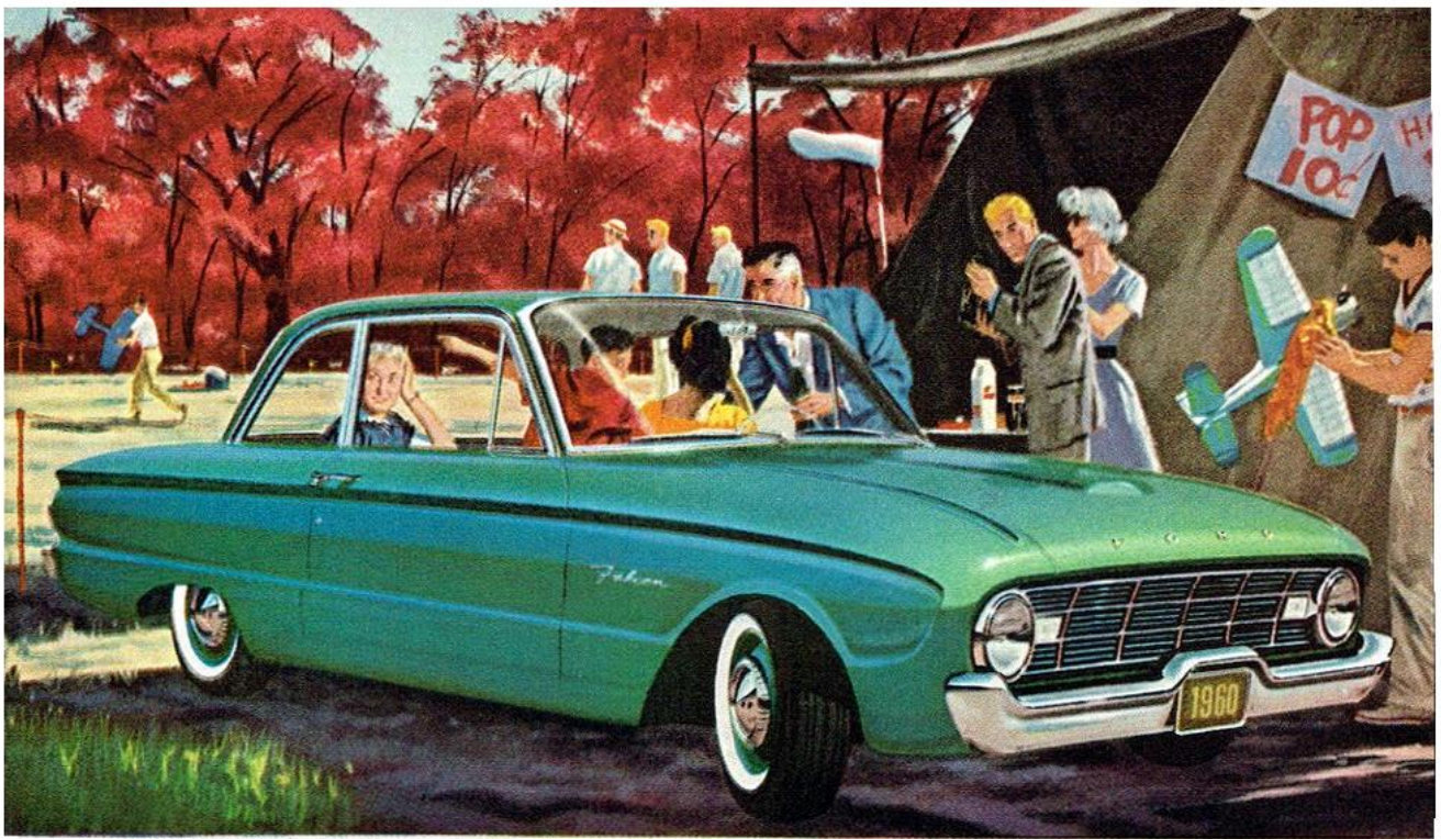
See "FORD STARTIME" in living color Tuesdays on NBC