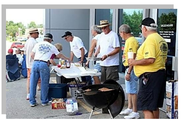
VOLUME 8, ISSUE 4, SEPT/OCT 2015