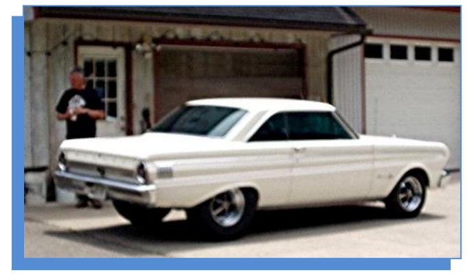
VOLUME 7, ISSUE 3, MAY/JUNE 2014