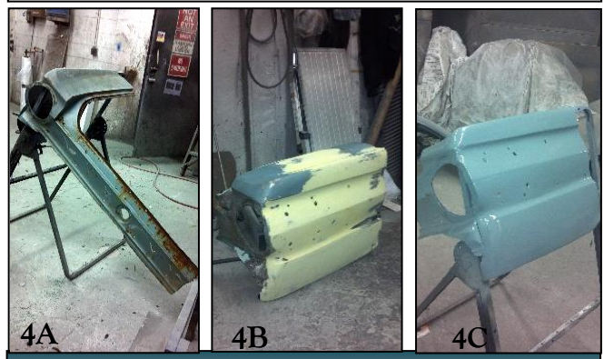
(4) It took a lot of metal work and plastic filler to get its shape back.