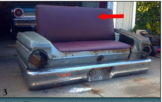
(3) The seat cushions are from a local restaurant that remodeled their booths.