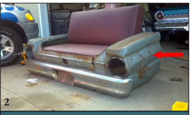
(2) The one problem with the donor car was the right quarter had been crushed by a phone pole.