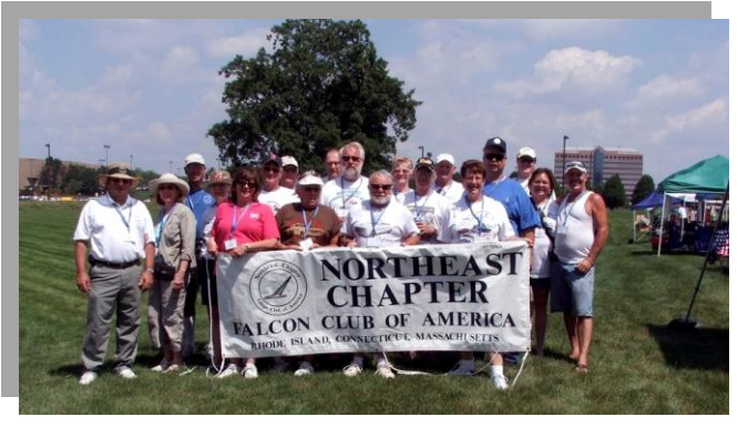
2010 FCA Convention Dearborn, MI VOLUME 7. ISSUE 2 MAR/APRIL 2014