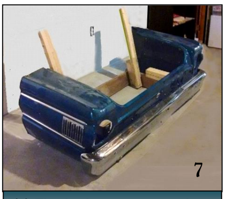
(7) The body was mounted on the frame and brackets made to hold the cushions.