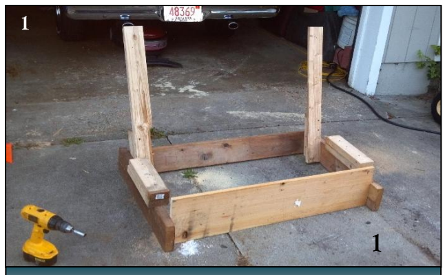
(1) I constructed a frame from 2×4s to hold the sheet metal.

S o, here's the story behind my Falcon couch. I've wanted to make a couch that looked like the butt end of my '64 convertible for over 20 years. My father in law had bought a '64 fordor parts car, so one day I decided it would be my donor.