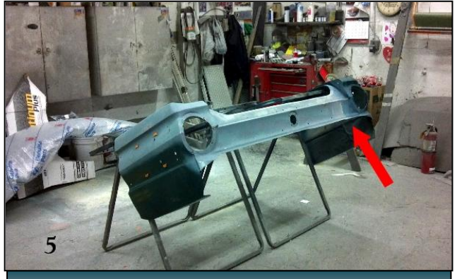
(5) The quarter panel was re-welded back on to the rest of the sheet metal.