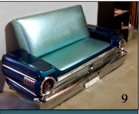
(9) I had plenty of extra chrome trim pieces to add the finishing touches.

(8) I dyed the cushions light turquoise to match my car interior.