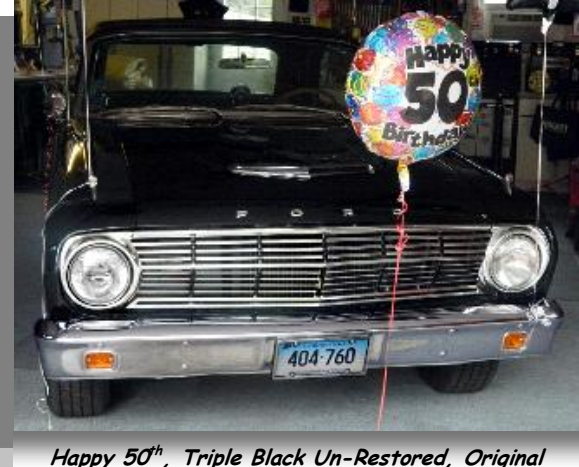
Happy 50<sup>th</sup>, Triple Black Un-Restored, Original Owner 63<sup>1</sup>2 Sprint Convertible

Editors Note: "I don't often give 50<sup>th</sup> birthday parties to cars my friends, but when I do I follow the rules." The 1<sup>st</sup> rule for giving your car a 50<sup>th</sup> birthday party is you have to be the 'Original Owner' The 2<sup>nd</sup> rule is it has to be a low mileage un-restored 'Triple Black Convertible', and finally The 3<sup>rd</sup> rule is you have to be 'The Most Uninteresting Man in the World'.