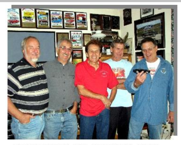
Members of CSRA. RVT. Town Council. and Me