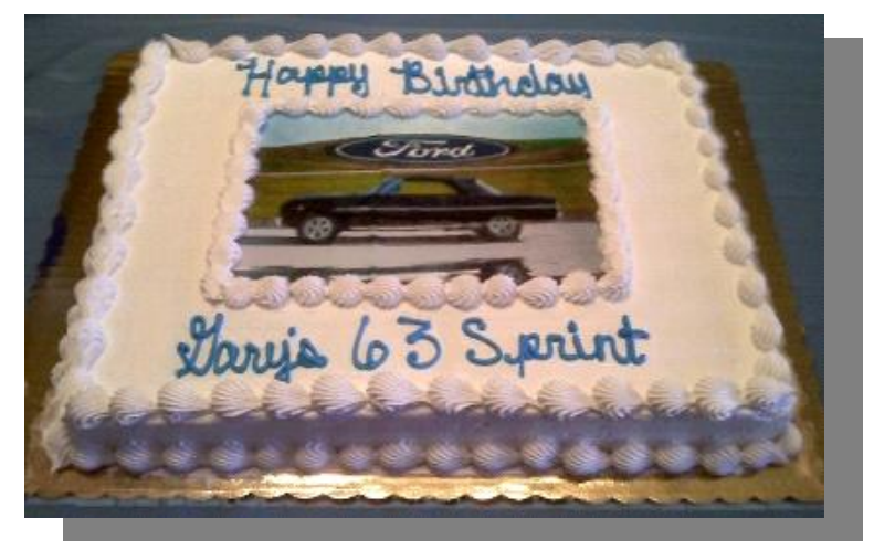
Volume 7, Issue 1, JAN/FEB 2014