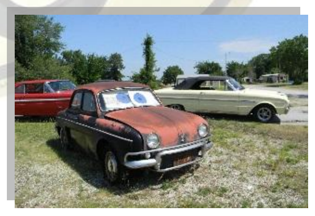
VOLUME 6, ISSUE 6 NOV/DEC 2013