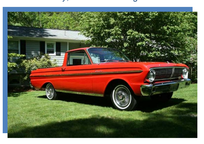
VOLUME 6, ISSUE 2 MARCH/APRIL 2013

As much as it hurt to see it go, I know it will spend its life in a good place. The Ranchero took us to a lot of locations on the east coast in pursuit of my longtime dream. It brought us great joy and we met a lot of wonderful people along the way. After all that's what life is all about. So, that's the rest of my Ranchero story, and I am sticking with it!